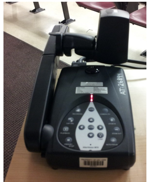
Digital Document Camera