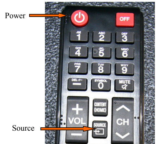
Remote control for the monitor.

Please remember to turn off the monitor and media devices when you are done using them! This saves energy and prolongs media device lifespan significantly.