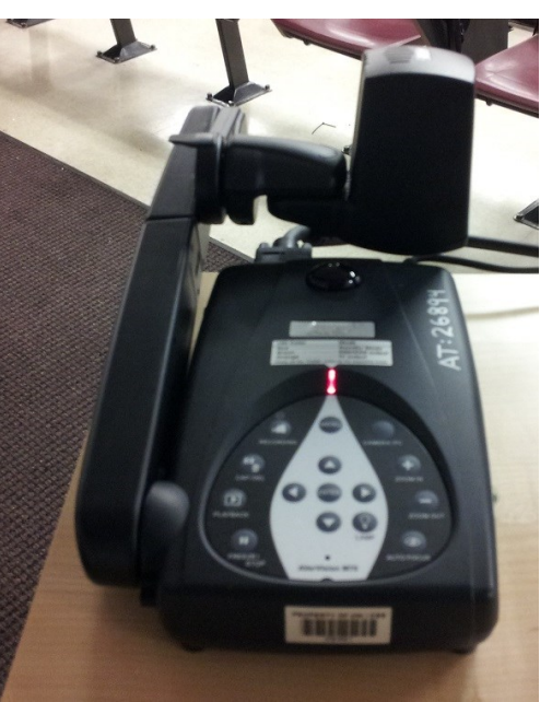
Digital Document Camera