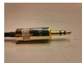
Stereo Mini Cable