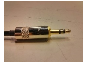
Stereo Mini Cable